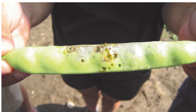
Figure 9. Signs of early pod feeding by young WBC larvae. Older, larger larvae are able to mine directly through the pod wall to feed on the bean seed.

Once pods are present, scout 100 plants (20 plants in 5 areas of the field). Look for signs of early surface feeding (Fig. 9) or complete holes within the pod. Take note if feeding is limited to one area of the field or is present in several areas. Try to determine if the feeding is caused by WBC. Other culprits are likely still actively feeding during the day. Slugs will have left slime trails on the pod surface or leaves. European corn borer or loopers and bean leaf beetles will likely be within the pod or on the plants.