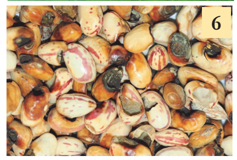
Figures 1-6. From top left to bottom right– 1. WBC adult moth. Photo credit: Jocelyn Smith, UGRC; 2– WBC larva. Photo Credit: Tracey Baute, OMAFRA; 3– Freshly laid WBC eggs on corn. Photo Credit: Tracey Baute, OMAFRA; 4–WBC leaf feeding damage on beans. Photo Credit–Chris DiFonzo, Michigan State University; 5–WBC pod feeding damage. Photo Credit–Jocelyn Smith, UGRC; and 6–WBC seed damage. Photo Credit–Chris DiFonzo, Michigan State University