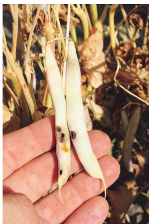
Figure 10. Pod feeding damage only found prior to harvest is too late for effective management.

Spraying too early when pods are not present on the plants will not protect the crop from damage. Spraying too late, when pod feeding has been taking place for some time will not reduce the risk of seed damage and disease (Fig. 10). The key is to protect the plants when the larvae are feeding on the