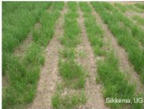
Roundup (0.33 L/ac)