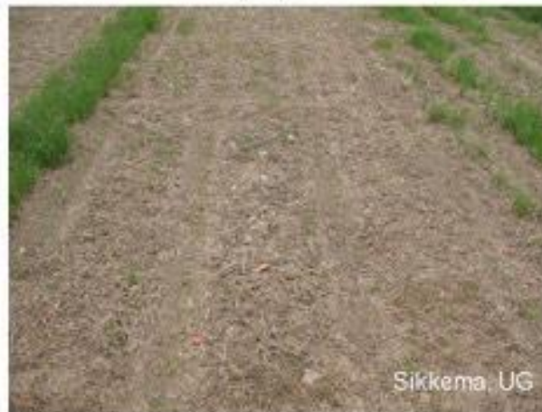
Roundup (2.00 L/ac)

Termination before corn: high-rate glyphosate (540g/L) + Ultim