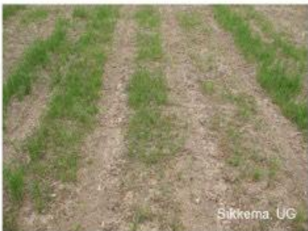
Roundup (1.00 L/ac)