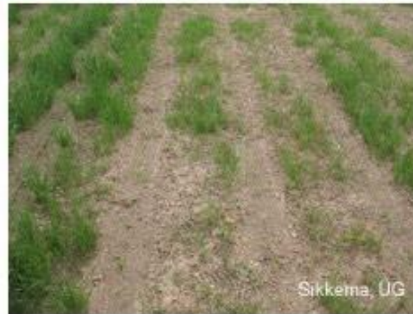
Roundup (0.67 L/ac)