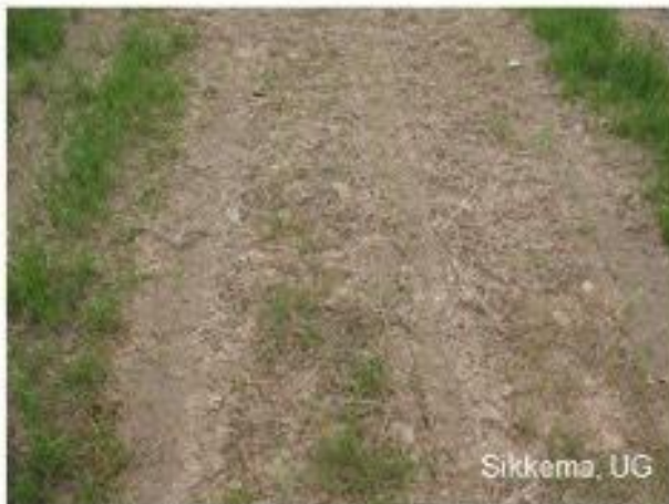
Roundup (1.33 L/ac)