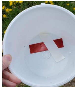
Figure 3. Vapour strip is taped inside the bottom or side of the bucket and lasts the entire season.