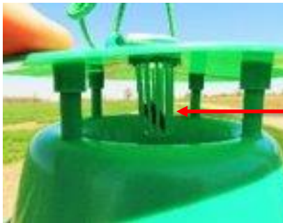
Figure 2. Pheromone lure is placed inside the cage above the funnel and is changed every three weeks.