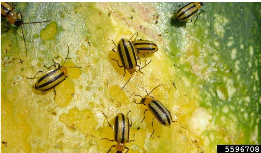
Figure 5. Striped cucumber beetles are also yellow and black but have well defined black stripes and dark undersides.

A look alike to the western corn rootworm is the striped cucumber beetle . The striped cucumber beetle is also yellow and black. Their stripes are well defined and reach to the end of their wings while abdomen and underside is black (Fig. 5).