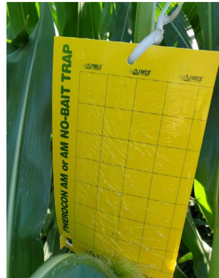
Figure 2. Pherocon AM No-Bait Sticky Traps are tied to each corn plant near the ear, removing any leaves that could get stuck in the trap. Iowa State University.