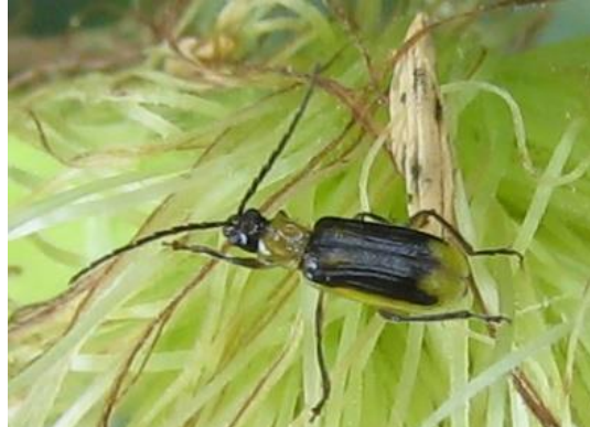
Figure 4. Male western corn rootworm adult. Their three stripes bleed together but do not reach the wing tips.

A look alike to the western corn rootworm is the striped cucumber beetle . The striped cucumber beetle is also yellow and black. Their stripes are well defined and reach to the end of their wings while abdomen and underside is black (Fig. 5).