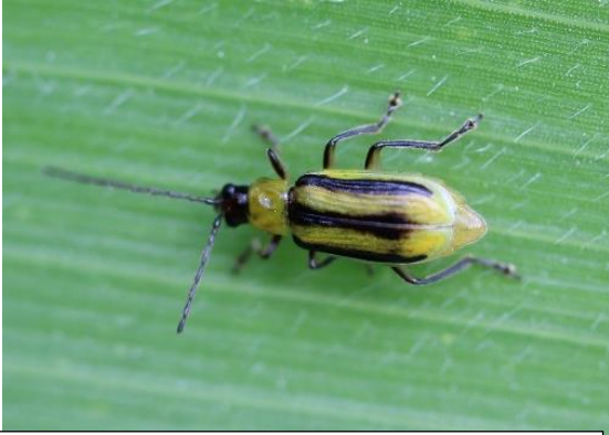
Figure 3. Female western corn rootworm adult. Their three black stripes do not reach the wing tips.

Western corn rootworm (WCR) adults are yellow to tan with three wavy black stripes that do not reach the end of their wings. Female stripes are wavy (Fig.3) and their wings are also shorter than their abdomens. Male's stripes bleed together (Fig. 4). Both female and male antennae and legs are black but their bodies/undersides are a dull yellow.