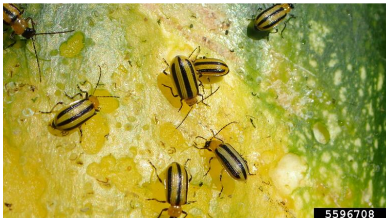
Figure 5. Striped cucumber beetles are also yellow and black but have well defined black stripes and dark undersides.

A look alike to the western corn rootworm is the striped cucumber beetle . The striped cucumber beetle is also yellow and black. Their stripes are well defined and reach to the end of their wings while abdomen and underside is black (Fig. 5).