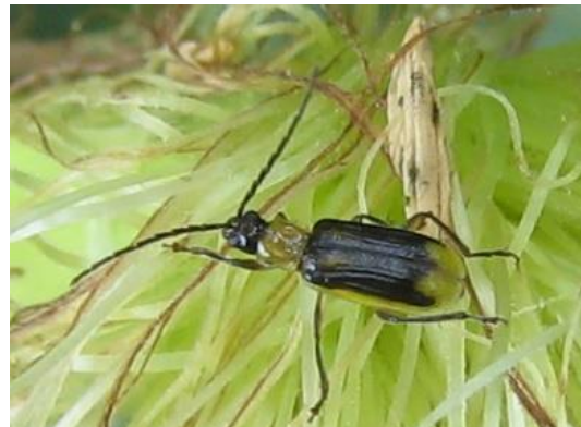
Figure 4. Male western corn rootworm adult. Their three stripes bleed together but do not reach the wing tips.

A look alike to the western corn rootworm is the striped cucumber beetle . The striped cucumber beetle is also yellow and black. Their stripes are well defined and reach to the end of their wings while abdomen and underside is black (Fig. 5).