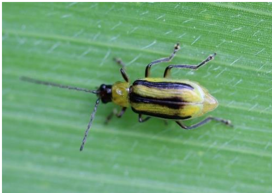
Figure 3. Female western corn rootworm adult. Their three black stripes do not reach the wing tips.

Western corn rootworm (WCR) adults are yellow to tan with three wavy black stripes that do not reach the end of their wings. Female stripes are wavy (Fig.3) and their wings are also shorter than their abdomens. Male's stripes bleed together (Fig. 4). Both female and male antennae and legs are black but their bodies/undersides are a dull yellow.