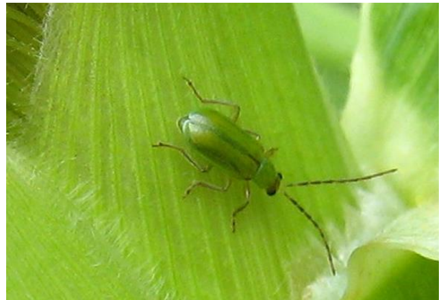
Figure 6. Northern corn rootworm adult females and males are green to tan in colour and have no stripes.