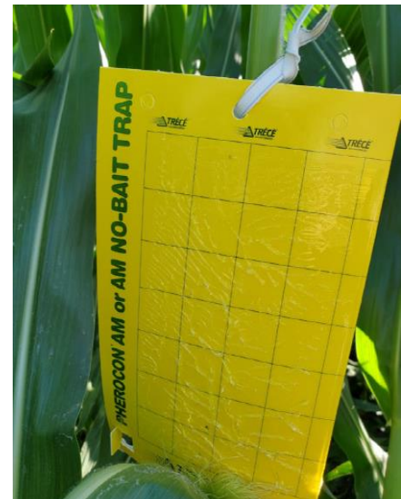
Figure 2. Pherocon AM No-Bait Sticky Traps are tied to each corn plant near the ear, removing any leaves that could get stuck in the trap. Iowa State University.